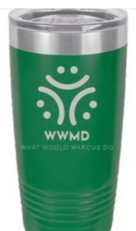
WWMD Green Tumbler